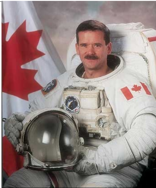
Canadian astronaut Chris Hadfield, VA3OOG