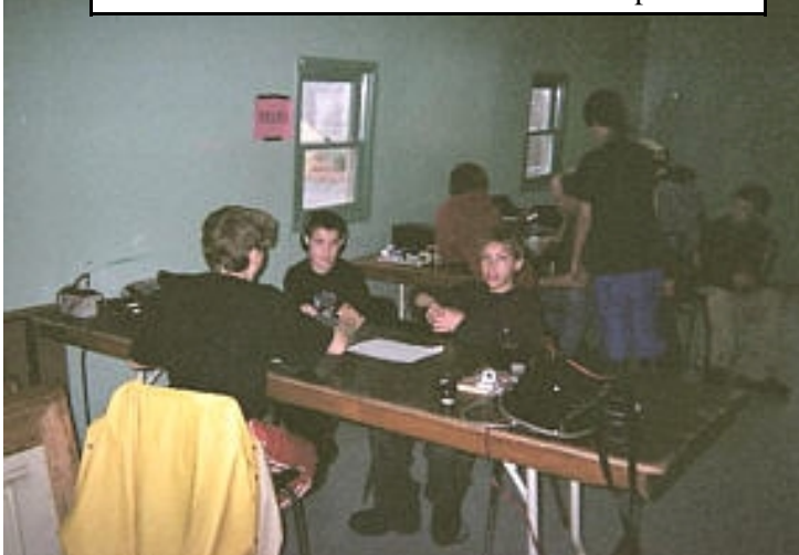
JOTA 2007 – Some of the scouts at Camp Harris