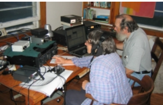
VA1YL and VE1MR operate the VC1W "Run" station in the old light-keeper's house.

As the contest wore on and people got tired, mistakes happened. Gary, VE1RGB, trying to copy some faint sig-