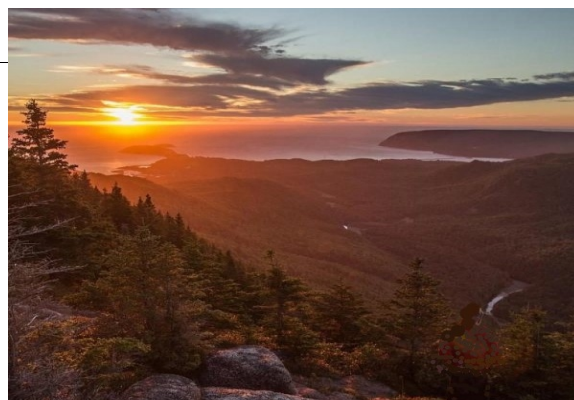
Cube Sats (Continued from page 4)

amateur satellite community with identifying the spacecraft and verifying that it is operational following its deployment at 0830 UTC.